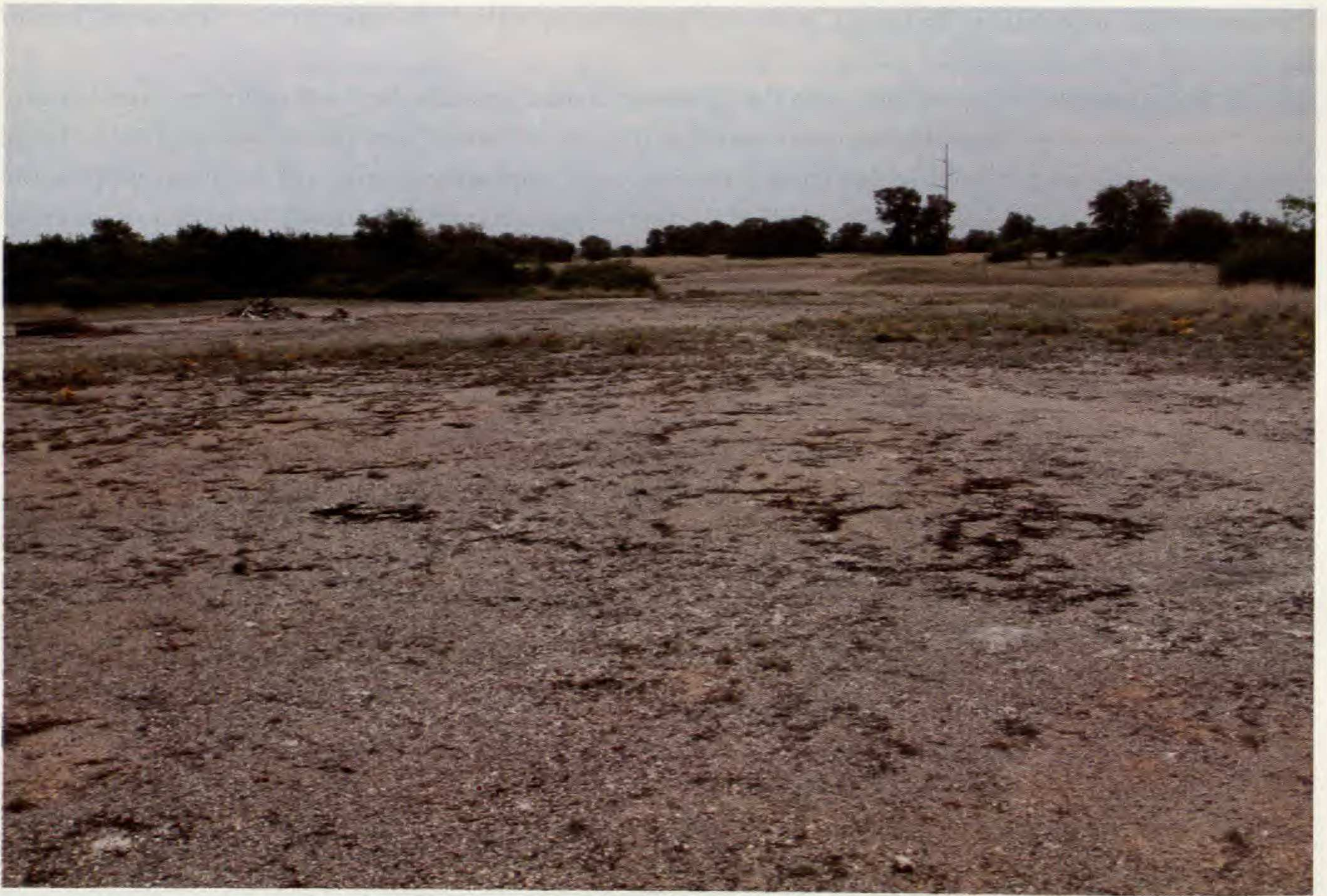
FIG. 3. Typical Dalea reverchonii habitat, Rocky Walnut Limestone glade with thin soil over exposed bedrock. Photo taken 24 Apr 2011, Utley site, Parker County, Texas.

cedar glades as D. reverchonii does in the Walnut Limestone glades. Both species in Series Purpureae thrive in shallow soil and cracks in exposed limestone bedrock (Barneby 1977). Baskin and Baskin (1988) suggest that marginal populations of widespread species, through catastrophic selection, "could result in narrow edaphic endemics...[and] may have played a role in the evolution of some of the rock outcrop endemic taxa, especially those that are closely related to widely distributed taxa within their geographic region." Both D. gattereri and D. reverchonii are on the margins of the geographic range of the closely related D. purpurea Vent. Catastrophic selection in marginal D. purpurea populations may have resulted in the evolution of both limestone glade endemic taxa.